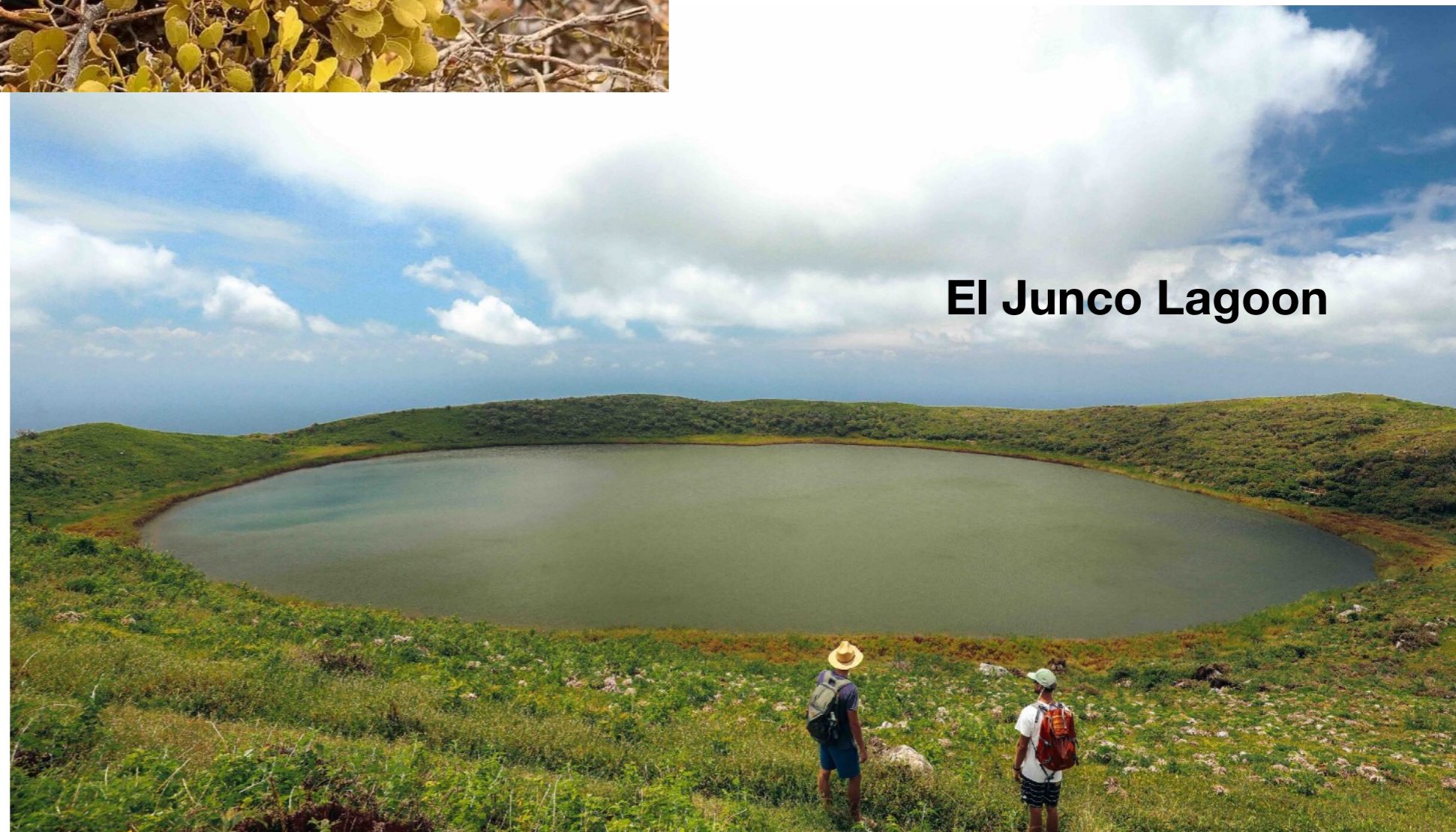
El Junco Lagoon

Students will record observations in a field/lab journal